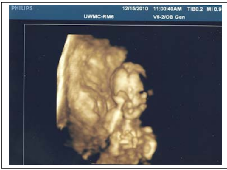
It's a boy and is due on June 4<sup>th</sup>!